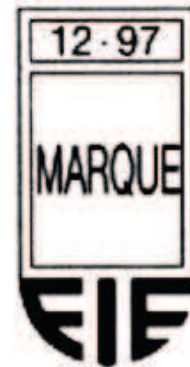
Figure 2- Label de qualité for blades

In order to help enforcing this the EFC-SEMI strongly recommends all national federations, clubs and fencers to insist with their manufacturers to have proof of homologation through a logo as foreseen by the FIE-rules.